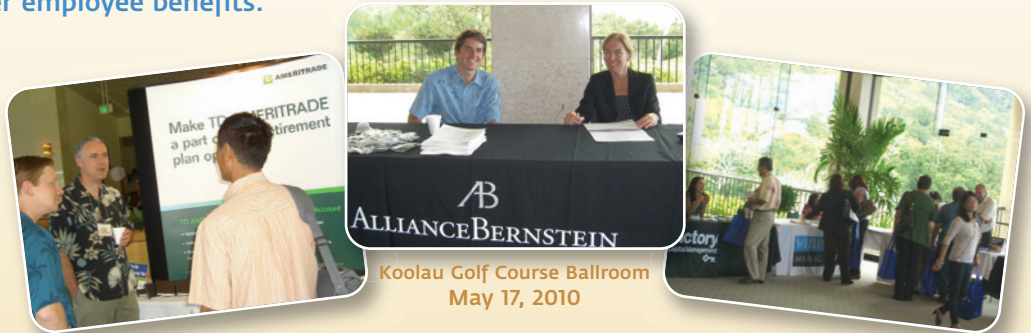
Koolau Golf Course Ballroom May 17, 2010

On May 17, 2010, approximately 150 employees attended the Fair at the Koolau Golf Course in Kaneohe. On May 19, more than 380 employees came to the Fair at the Hawaii Okinawan Center in Waipahu. In addition to receiving information about the Plan and other employment benefits, employees met with representatives of the Plan's various investment funds and spoke face-to-face with members of the Plan's Board of Trustees. Surveys received from attendees indicated that the Fairs have been very informative, beneficial, and well represented by both the Plan's investment fund managers and the State's benefit plan providers. Thank you all for your feedback and continued support of the Fairs! ●